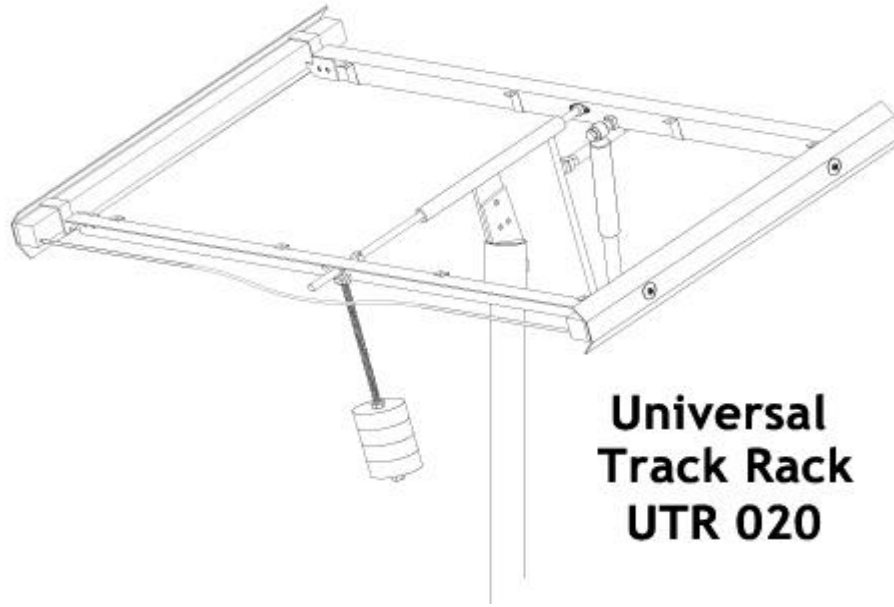
Universal Track Rack UTR 020